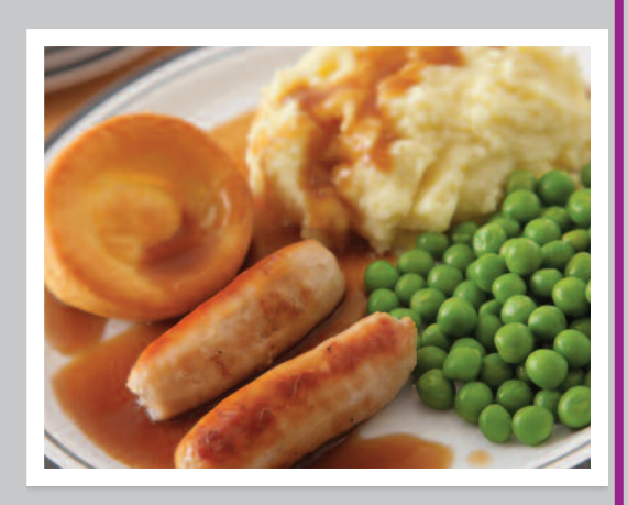
Sausages & Yorkshire Pudding served with Mashed Potato & Seasonal Vegetables & Gravy