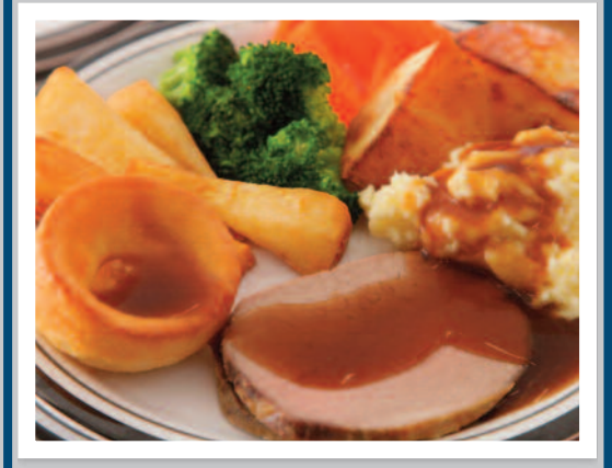
Roast of the Day served with Roast/Mashed Potatoes, Seasonal Vegetables & Gravy