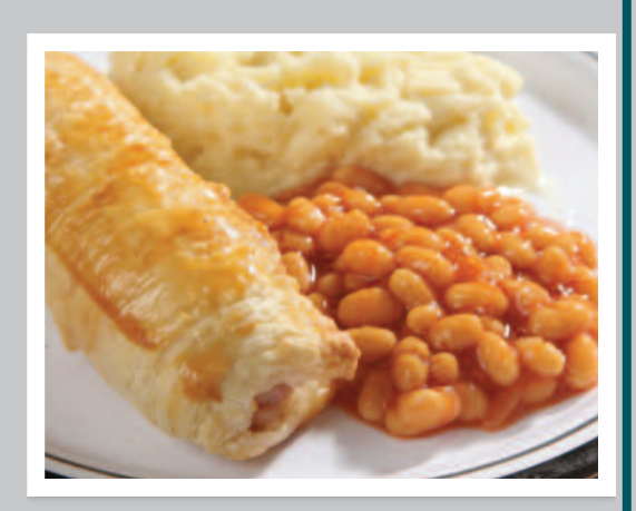
Homemade Sausage Roll served with Mashed Potato & Baked Beans