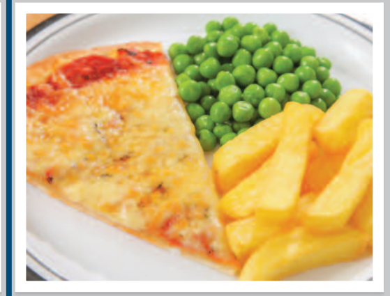
Cheese & Tomato Pizza served with Chips & Peas or Baked Beans