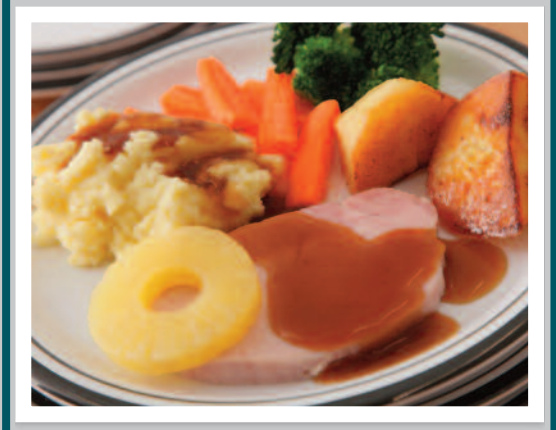
Roast of the Day served with Roast/Mashed Potatoes , Seasonal Vegetables & Gravy