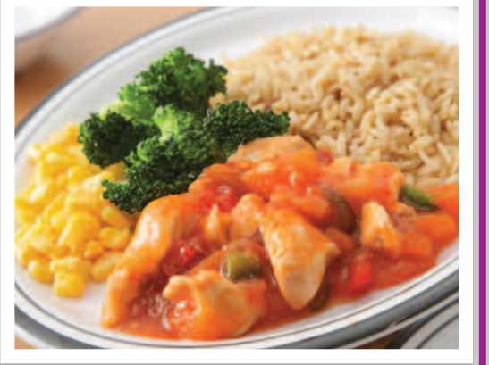
Sweet & Sour Chicken served with Rice & Seasonal Vegetables