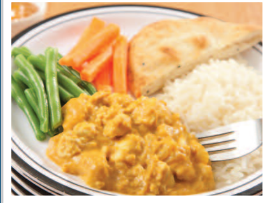
Chicken Korma served with Rice, Naan Bread & Seasonal Vegetables