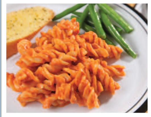
Tomato & Mascarpone Pasta served with Garlic Bread & Seasonal Vegetables