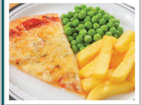
Cheese & Tomato Pizza served with Chips & Peas or Baked Beans