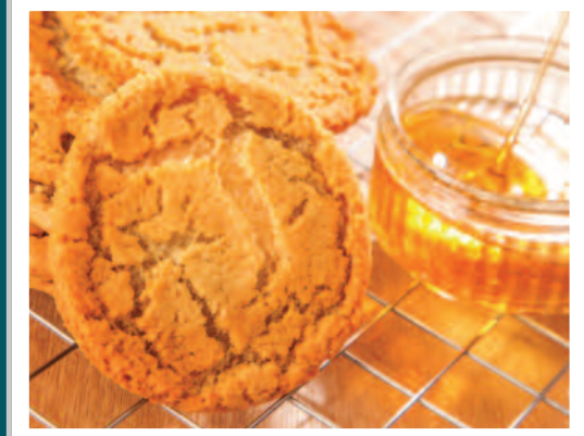
Golden Crunch Cookie