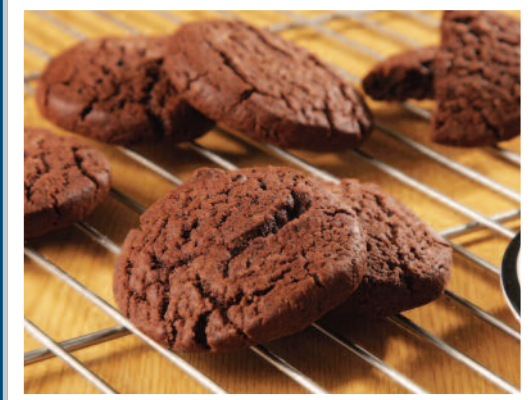
Chocolate Orange Cookie