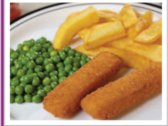
Fish Fingers served with Chips & Peas or Baked Beans