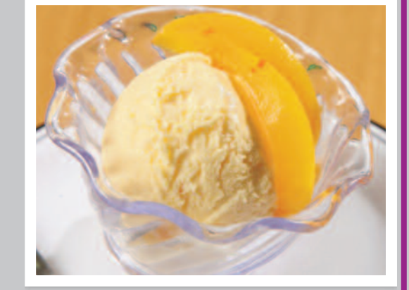
Ice Cream & Fruit